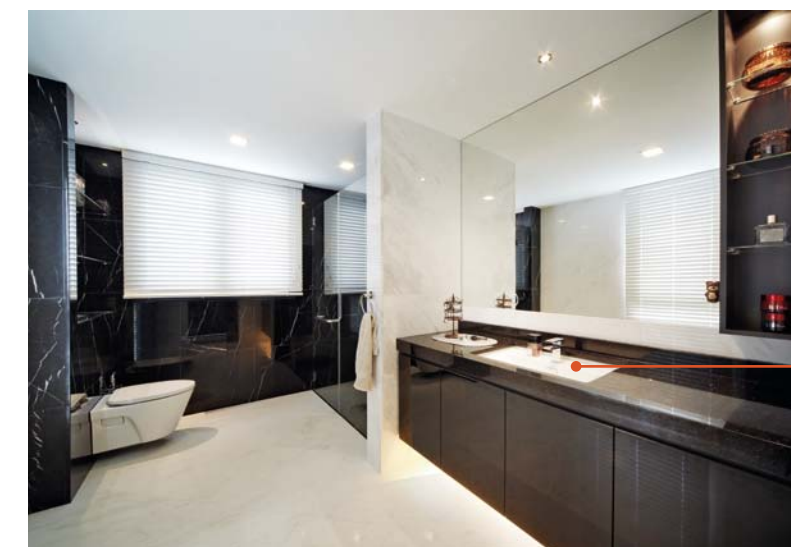
Vanity top from Ego Marble

The bathrooms in this house are just as impressive, each with its own style and look. Using a combination of luxurious marble walls and glossy floor tiles, the designers managed to achieve a sense of understated luxury in each space. And with the added effects from the alcove lighting, the bathrooms appear clean and airy. ■