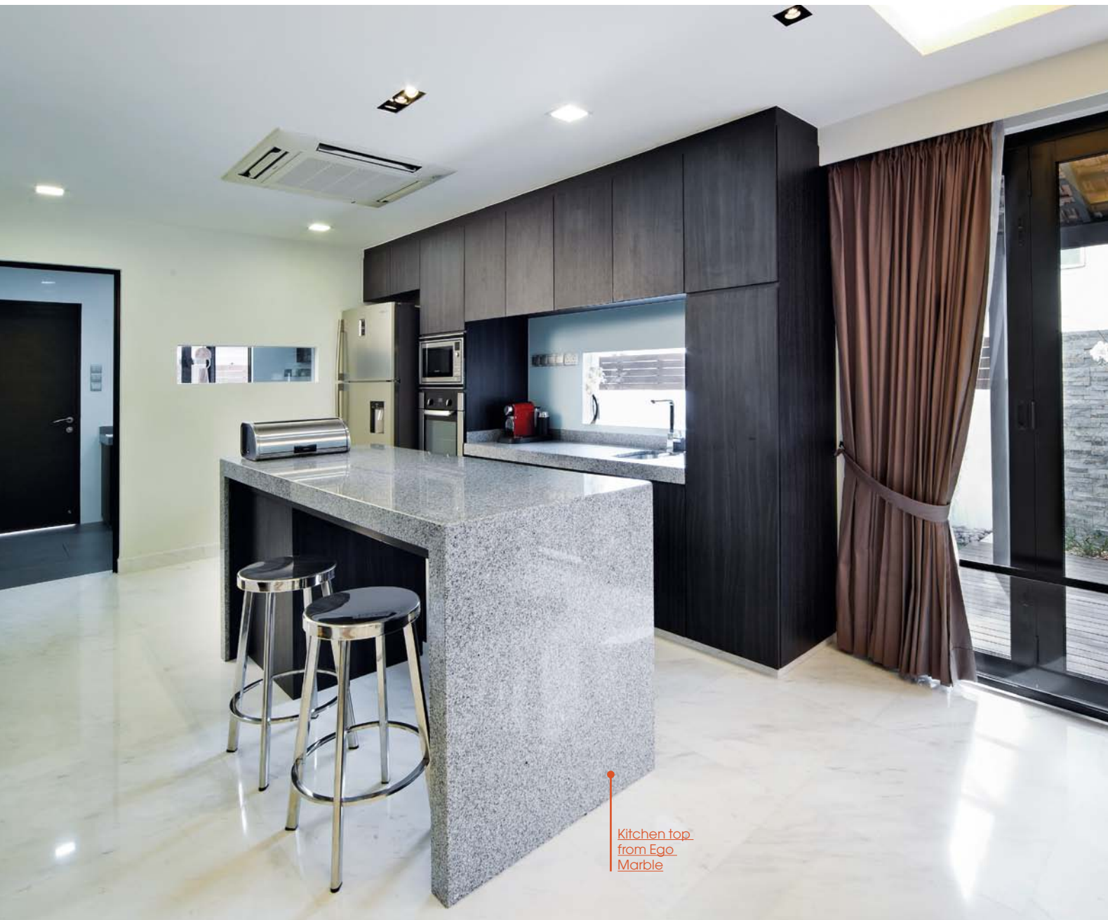
Kitchen top from Ego Marble