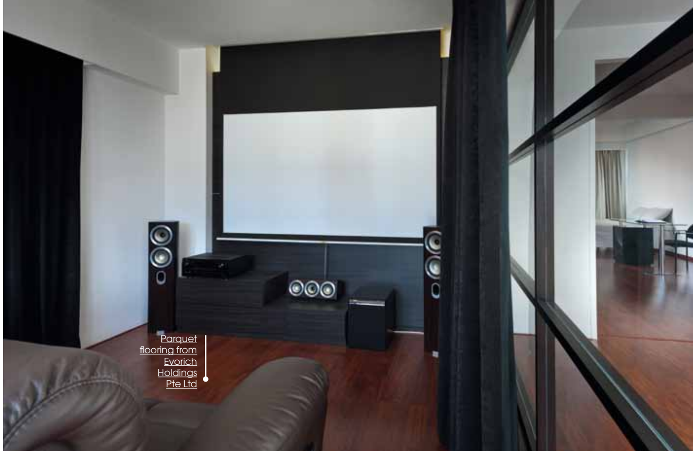
Parquet flooring from Evorich Holdings Pte Ltd