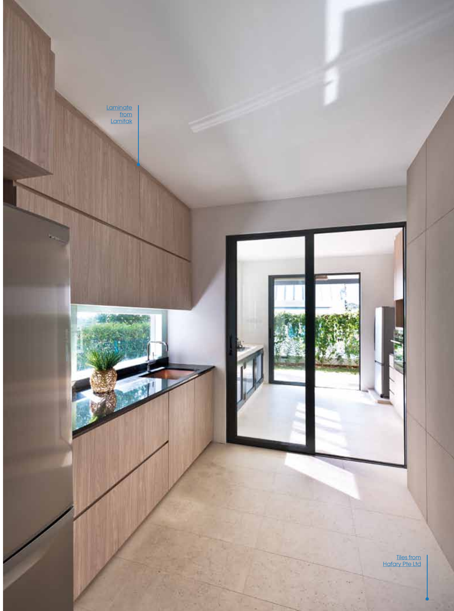
Laminate from Lamitak