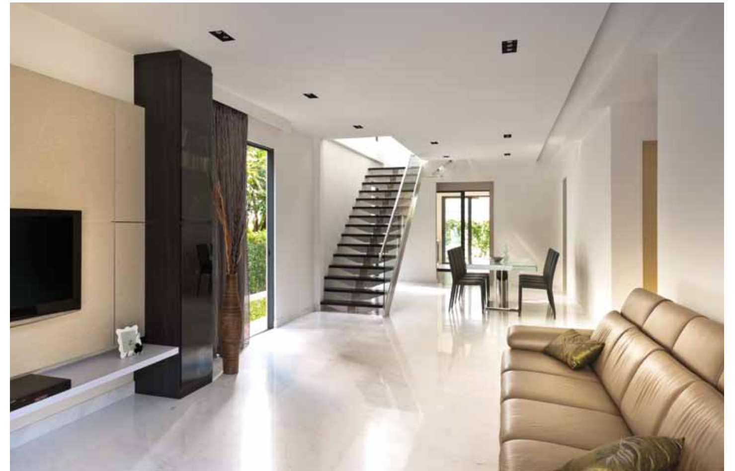
Tiles from Hafary Pte Ltd

To offset the pristine whiteness of the walls and floors, the designers infused the living room with beige and brown accents.