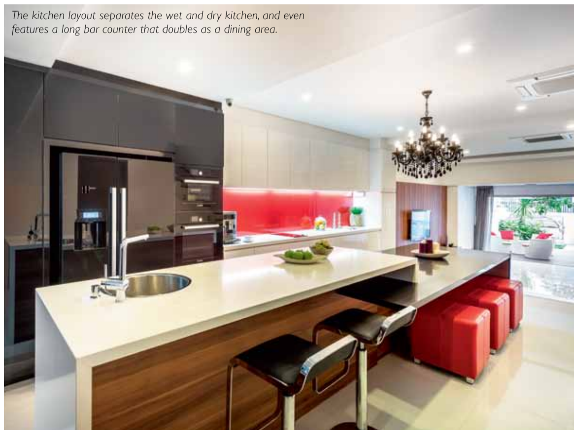
The kitchen layout separates the wet and dry kitchen, and even features a long bar counter that doubles as a dining area.

In the dining area, the choice of furniture keeps the space visually light. The only striking detail here is none other than the luxurious chandelier, which acts as a surprising finishing touch.