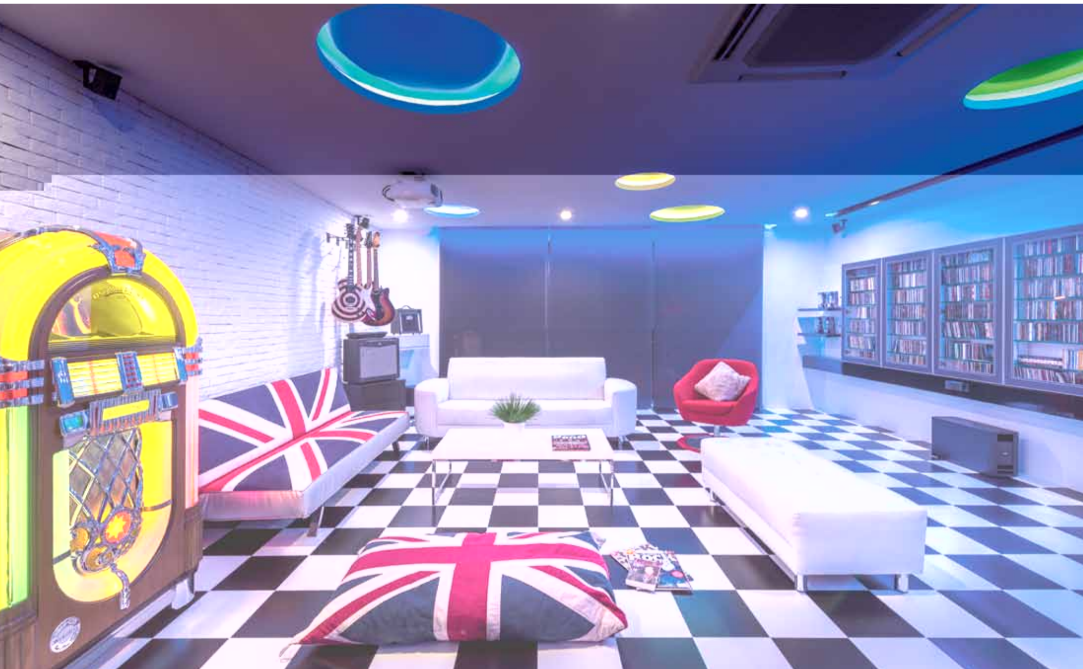
Colours, textures and lighting are melded seamlessly in this room.

Combining distinctly different interior design themes is a path that designers usually tread with caution. The result can vary from one extreme to another, but with this project, interior design firm ID Emboss has proven that matching three different interior design themes is not only possible, but also packs a punch.